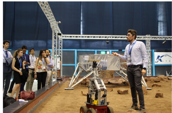
Static exhibition of rovers developed by ALTEC and Thales Alenia Space.

Special thanks goes to ALTEC and Thales Alenia Space for their hospitality and support to the MetroAeroSpace organization. It is worth to note a technical visit offered to all attendees to the main ALTEC facilities including the ExoMars 2020 Rover Operations Control Center (ROCC). The ROCC is the center that will receive daily from Mars the telemetry data of the Rover and will send the sequences of commands to indicate to the Rover which activities to carry out day by day (or better, sol by sol) on the Red Planet, once landed and the exit phase from the landing platform is completed.