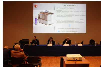
A Special Track on Military Metrology for AeroSpace was organized by AFCEA Naples Chapter with patronage of AFCEA Europe, more information are available at; http://www.metroaerospace.org/military/

Manuscript received January 1, 2019; accepted January 1, 2019, and ready for publication September 10, 2019.